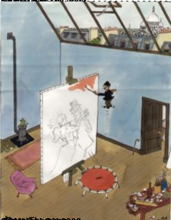
2003. SALON 2003