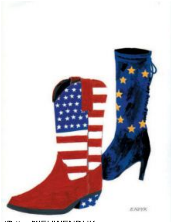
TRIAESTINSALON 2007. -----