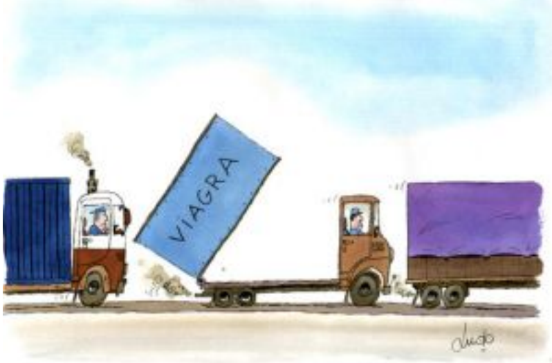
TRIAESTINSALON 2008. -----