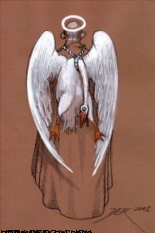
2017. SALON 2017