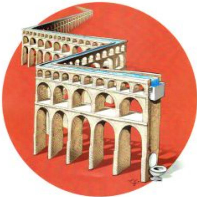
ČERNIŠEVA SALON 2010