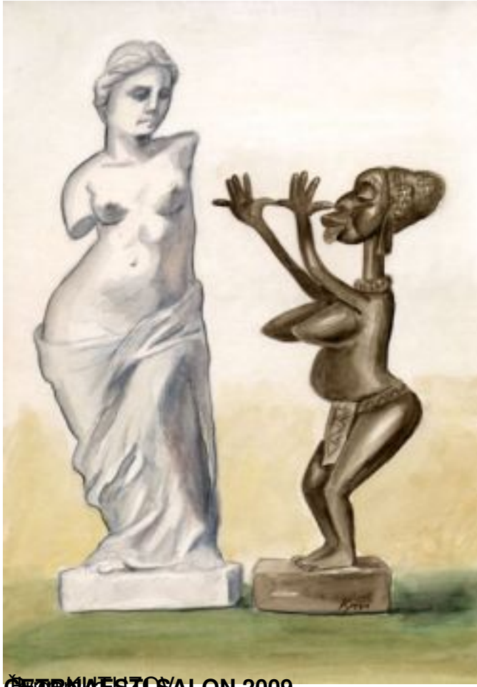
ČERNIŠEVA SALON 2009